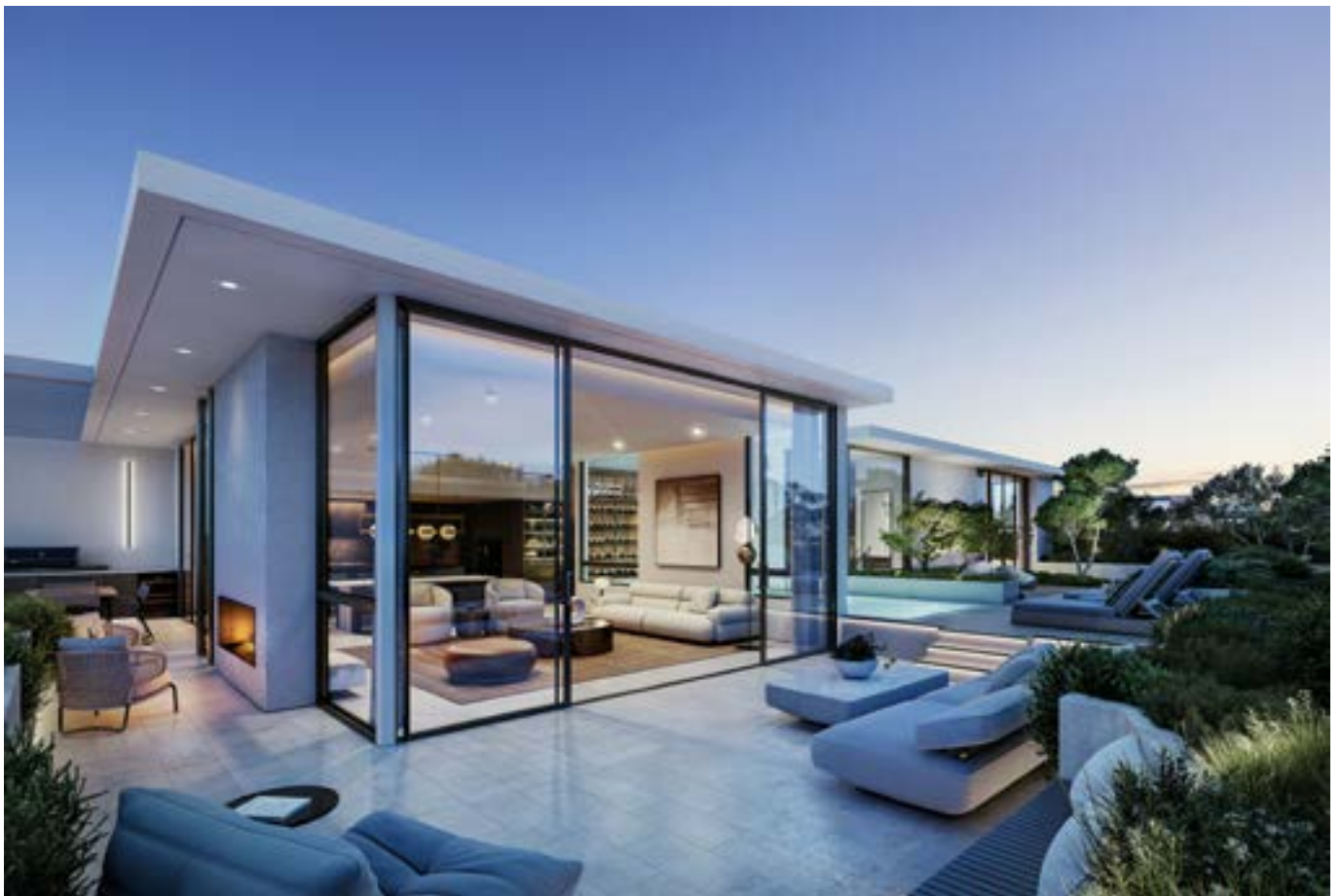
Artist impression of one of the two penthouses at EDEN, Stage 3 of the East Side Quarter development.

EDEN at ESQ includes two penthouse apartments on Level 4 of Building G. Developer CUBE collaborated with the purchasers to take into account their specific requirements and design requests. With three bedrooms, over 200sqm of floor space each, indoor /outdoor fireplace, outdoor built-in kitchen, one with a roof-top lap pool, these design elements combine to indulge our purchasers in a truly 5-star home.