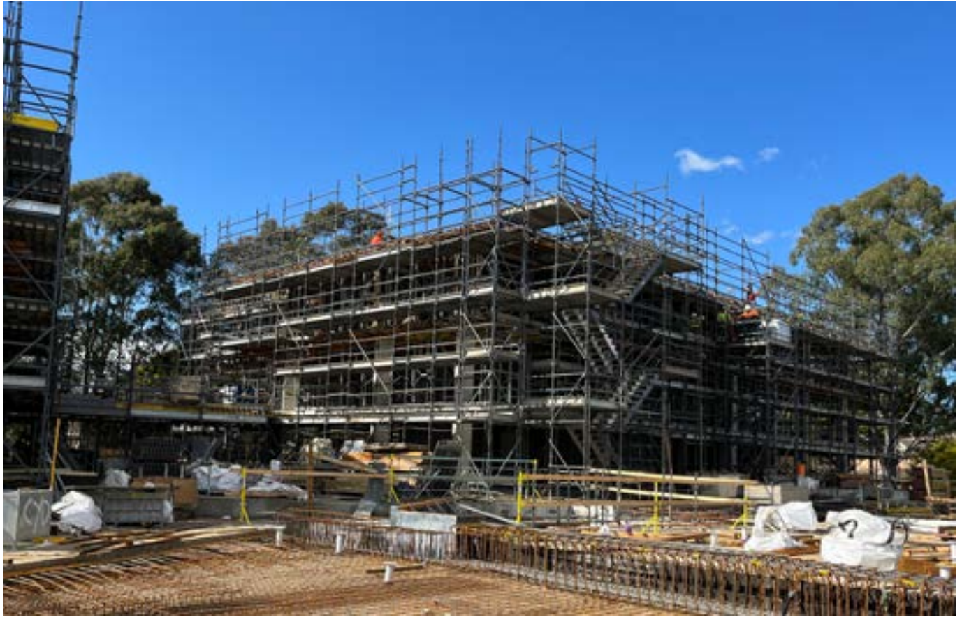
View of Building E (east) being prepped for roofing - all four levels now poured